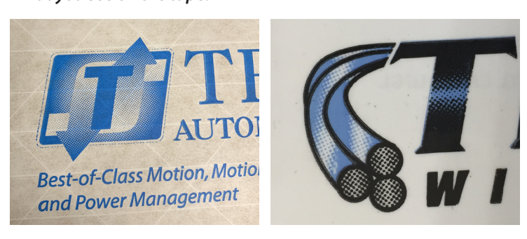
(Actual dot representations may vary.)